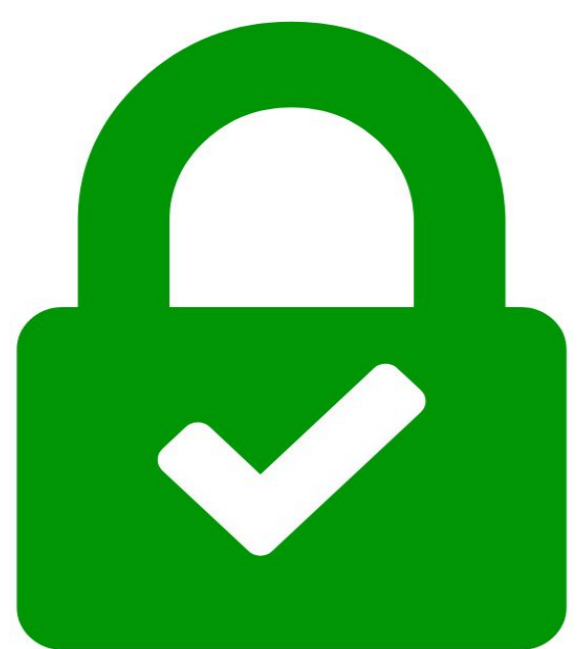
Figure 1. Formal Verification icon used in the first study to represent formal verification in the PM's interface

To understand users' views on formal verification we designed and implemented two studies .